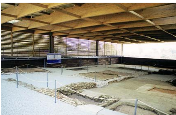
Archeologic area of Fregellae

The town of Ceprano stands in a place which is significant for the reconstruction of the history of Italy in pre-Roman and Roman ages.