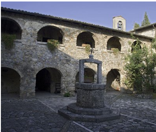
Ceprano: cloister of S. Antonio Abate

Where once run the Via Latina, on the ruins of ancient Fregellae, Ceprano rises today with a very interesting archaeological Museum.