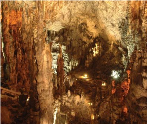
Collepardo: the Cave of Regina Margherita

Heading towards Collepardo one guesses immediately that in this corner nature has been really generous.