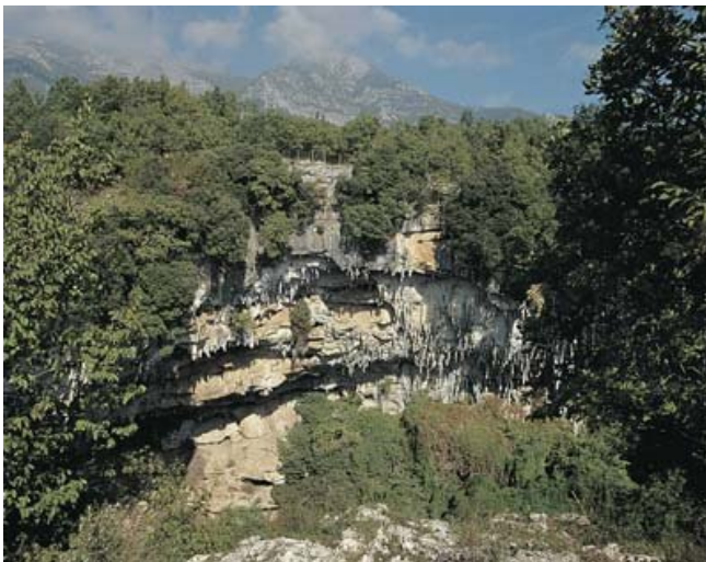
The Well of Antullo

Going down the gorge of the wild stream Rio, amid threatening but splendid high walls there is the entrance to the cave. This leads to large rooms which penetrate in the bowels of the earth for at least 180 m with vaults and walls covered with stalactites and stalagmites.