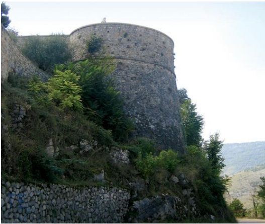
Castro dei Volsci: medieval tower

The triumph of the Middle Ages in Ciociarian villages: when bare stone becomes art